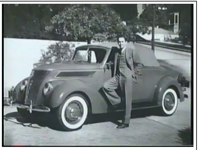
<u>"Ford & the American Pream"</u> Click the above picture to watch the video